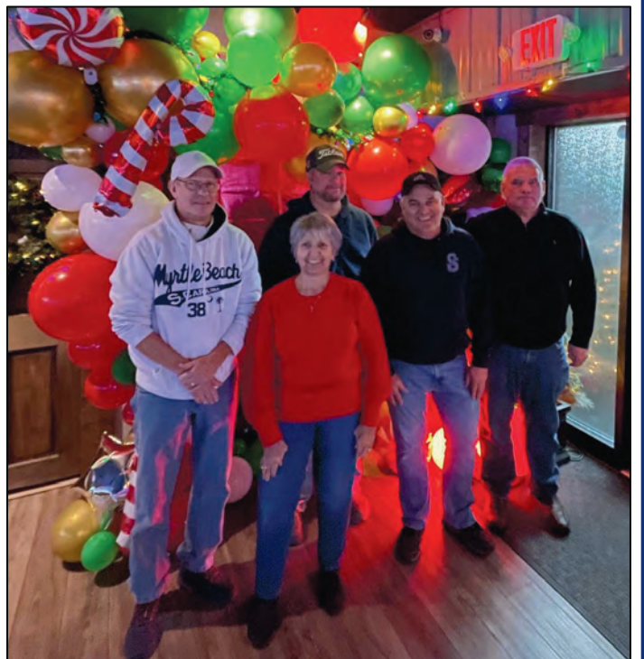
Members of Sokol Lodge 255 share some fellowship at their annual Christmas party.

Nazdar! The Officers of Lodge 32 Boonton, N.J.