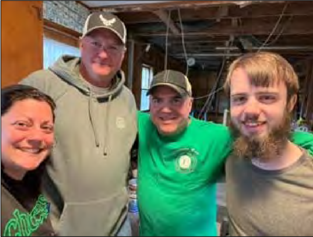
Sokol Lodge 30 members celebrating St. Patrick's Day at the club for their annual fundraiser.