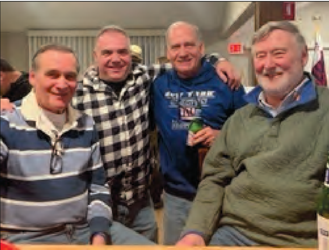
Sokol Lodge 30 members celebrating during the Super Bowl at our annual fundraiser.